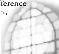
© Knights of Columbus, 1 Columbus Plaza New Haven CT 06510

Aldrin D'Cunha 289-828-5253 aldrin.dcunha@kofc.org